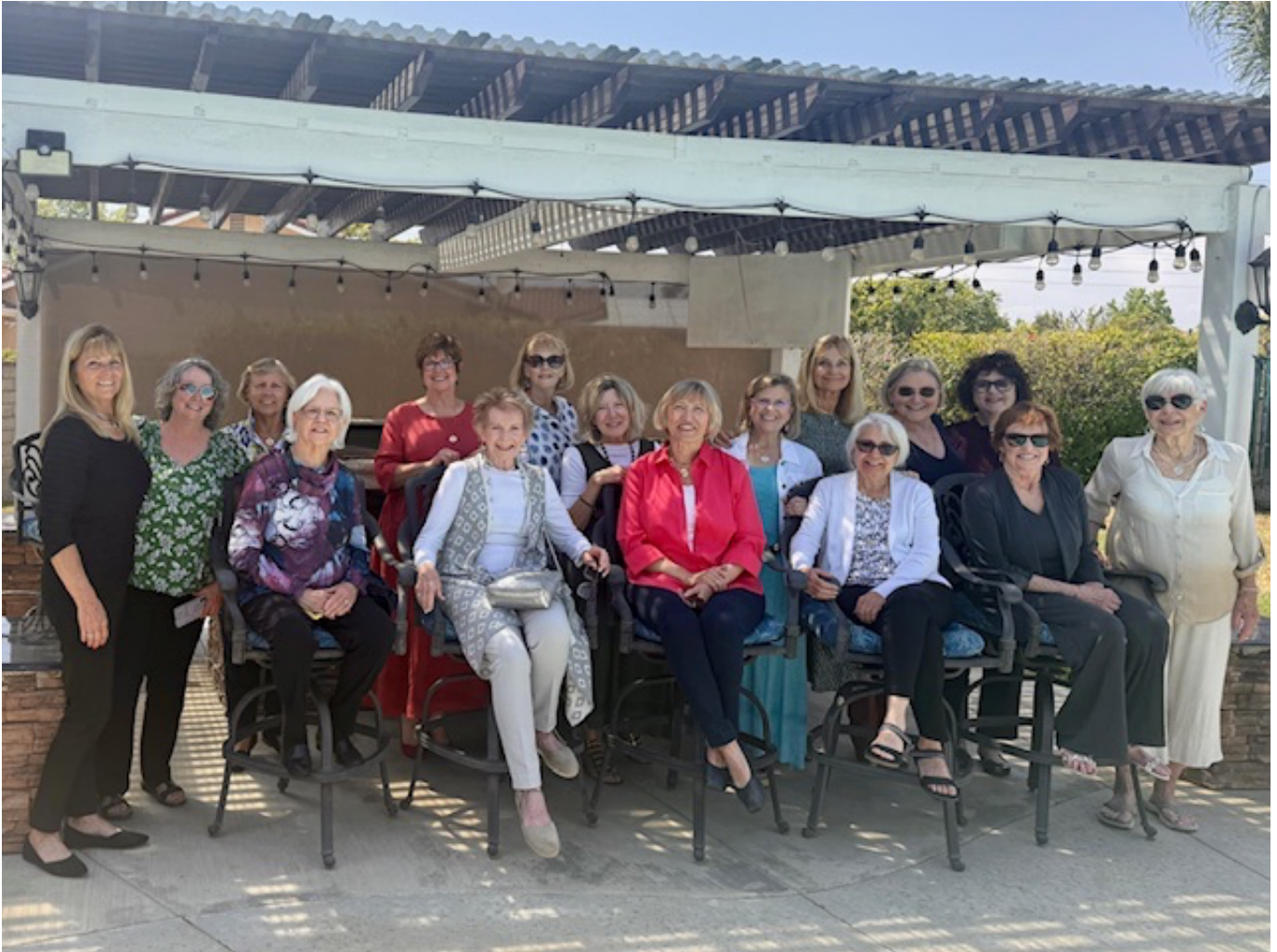
Presidents: Past, Present and Future