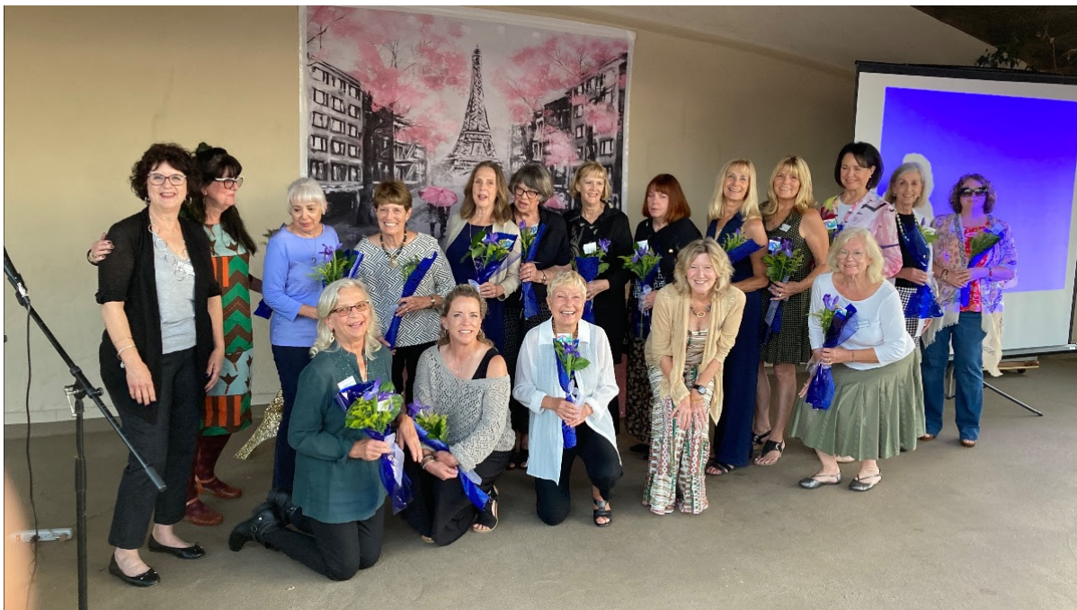
Your 2022-2023 Art Alliance Board Members